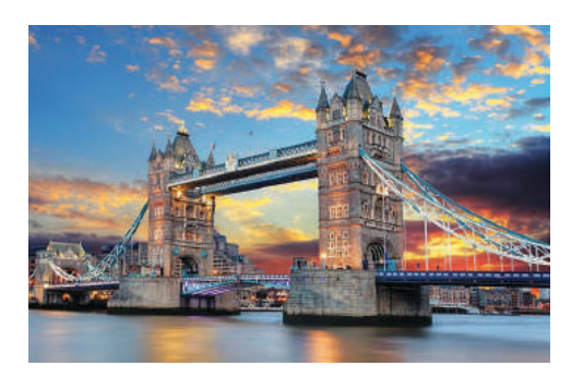
Lastly, you will be required to collect your Biometric Residence Permit within 10 days of arriving in the UK.